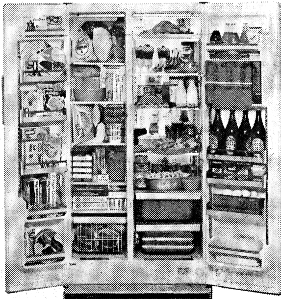
H. 66" x W. 33" x D. 26 1/2"

ILLUSTRATED: RSP 204 a 20 cu. ft. side-by-side frost-free Refrigerator/Freezer.