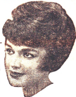
Morning & Afternoon Tea Available

655 DARLING STREET, ROZELLE (next Post Office) — PHONE: 82-1503