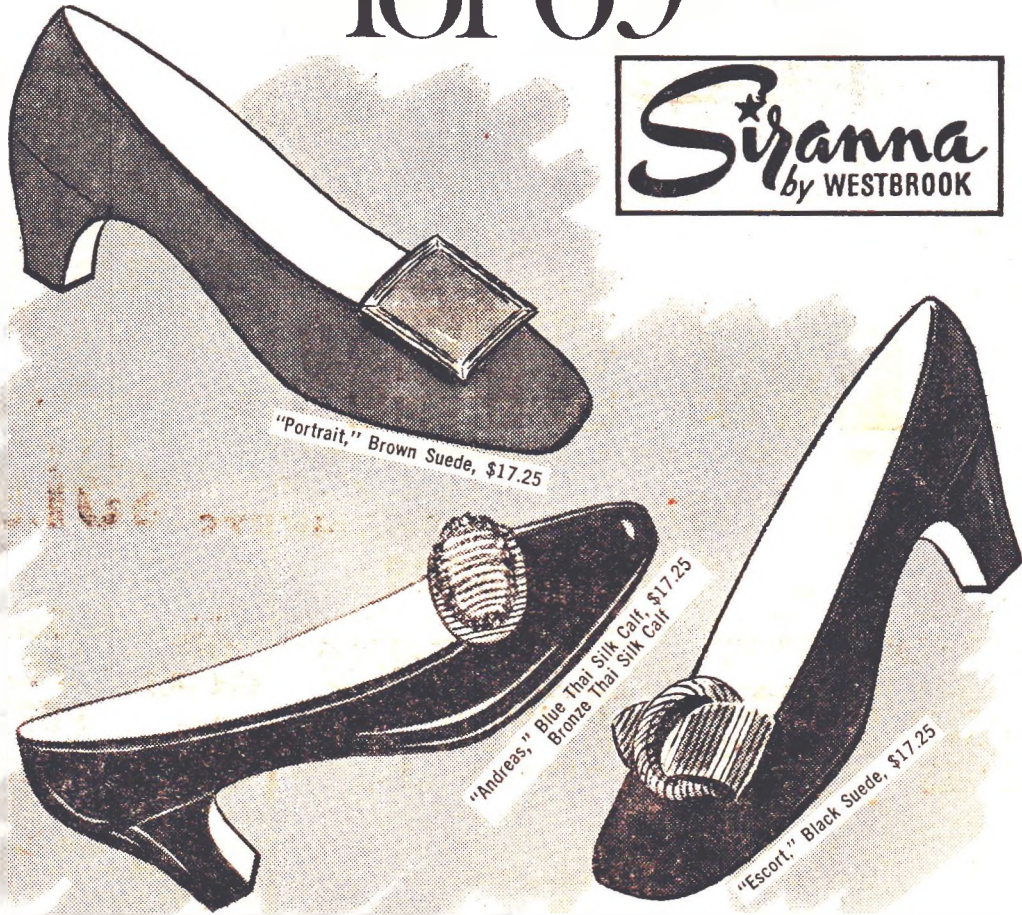
"Portrait," Brown Suede, $17.25