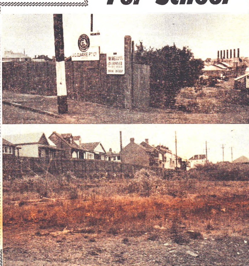
Here are two views of the 8½ acre block of land fronting Terry Street, Rozelle, which the Government has bought for the purpose of constructing a new high school.