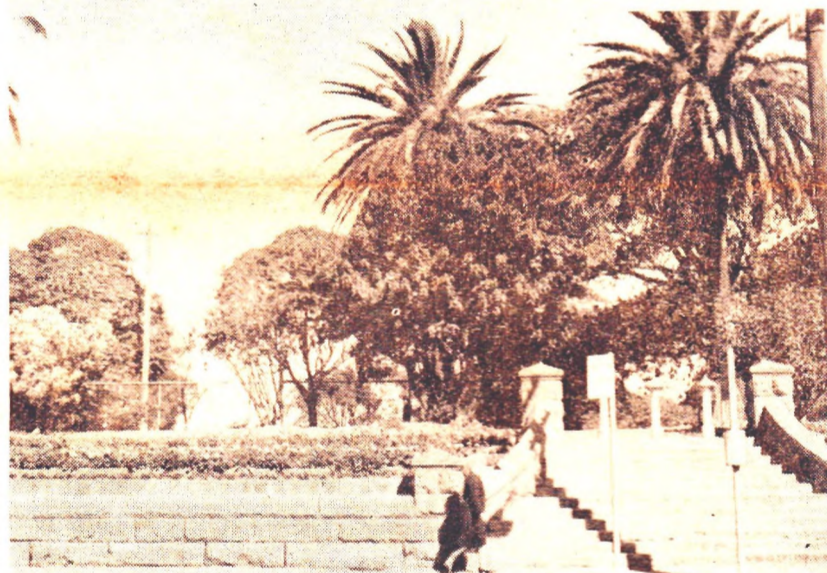
Balmain's public gardens provide a restful atmosphere in these days of increasing industrialisation. Residents should be—and undoubtedly are—proud of the suburb's two major parks, one in